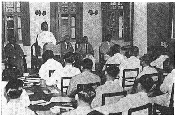
Y.T.M. Tunku Abdul Rahman Putra berucap kepada Pegawai-pegawai Kerajaan yang menjalani Kursus Latihan Perkhidmatan Eksekutif di Kuala Lumpur pada 5hb Oktober, 1957