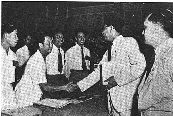
Y.T.M. Tunku Abdul Rahman Putra selepas Pembukaan Mesyuarat Agung Tahunan Persatuan Kelab Pemuda Malaya di Kuala Lumpur pada 3hb Mac, 1957