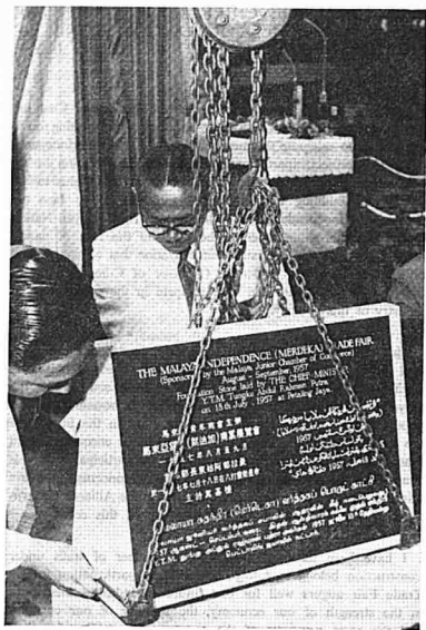
Y.T.M. Tunku Abdul Rahman Putra meletakkan batu asas Pesta Perdagangan Malaya Merdeka di Petaling Jaya pada 18hb Julai, 1957