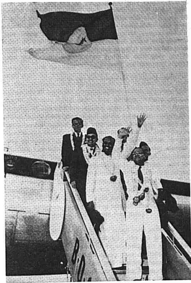
Y.T.M. Tunku Abdul Rahman Putra dan ahli-ahli Rombongan Malaya ke London melambai-lambai kepada kumpulan besar orang ramai yang berada di Lapangan Terbang Kuala Lumpur untuk mengucapkan selamat jalan kepada mereka pada 9hb Mei, 1957