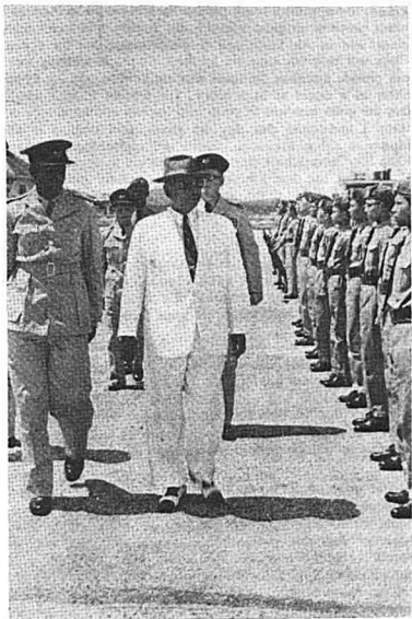
Y.T.M. Tunku Abdul Rahman Putra memeriksa perbarisan Skuadren Yang Pertama Tentera Udara Persekutuan Tanah Melayu di Kuala Lumpur pada 19hb Oktober, 1957