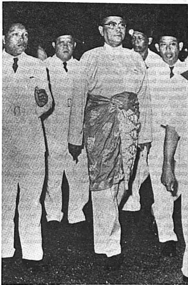
Y.T.M. Tunku Abdul Rahman Putra tiba di Perhimpunan tengah malam untuk meneriakkan Merdeka di Padang Kuala Lumpur pada 30hb Ogos, 1957