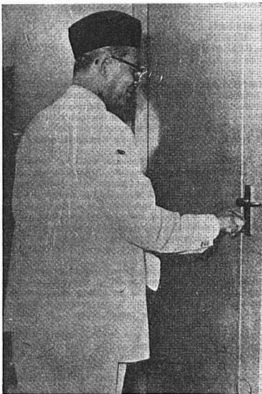
Y.T.M. Tunku Abdul Rahman Putra, dengan menggunakan kunci yang diperbuat daripada emas, sedang membuka pintu besar bangunan Ibu Pejabat dan Makmal Bahagian Penyelidikan, Jabatan Galian di Ipoh pada 4hb Mei, 1957